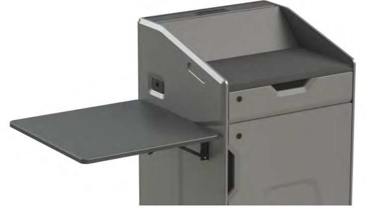
SH-FL-EX installed on LEX30 Lectern (Sold separately)